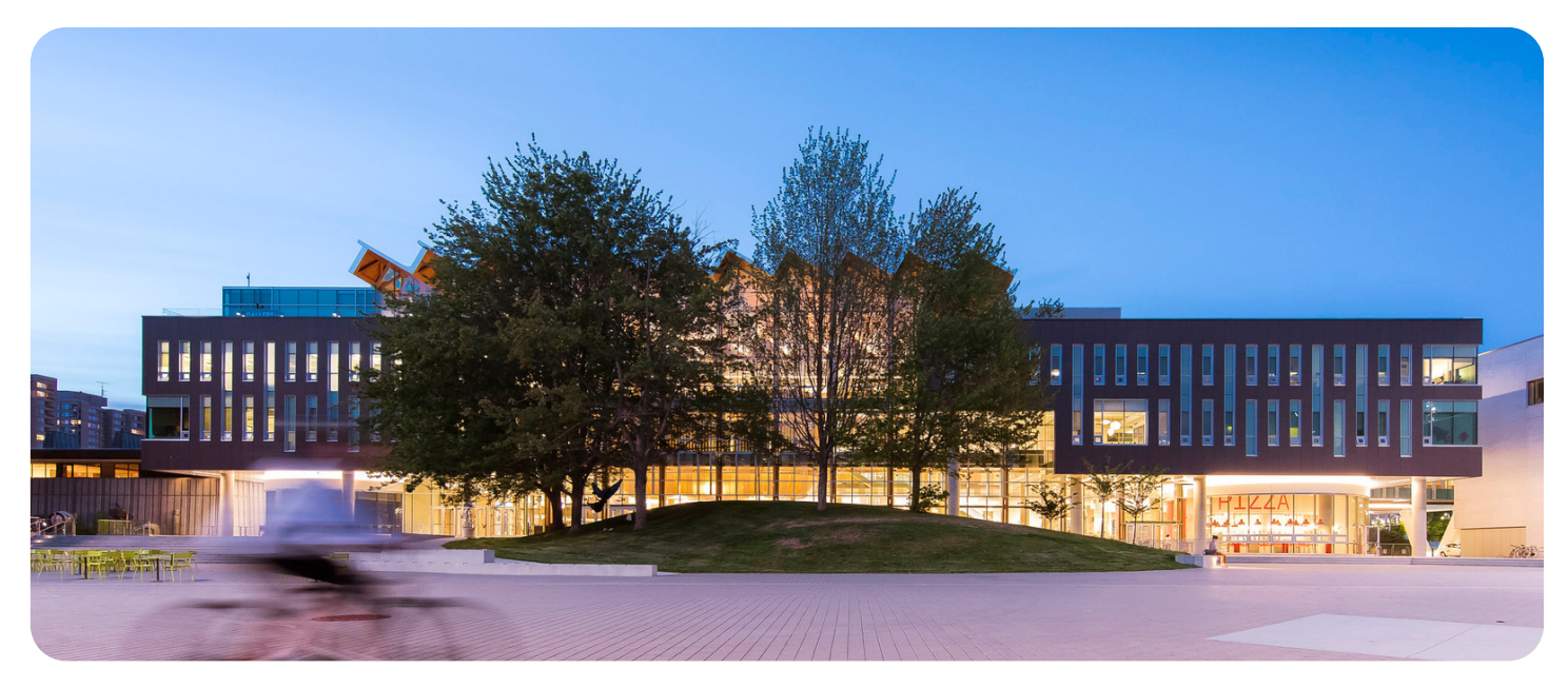
The NEST at the University of British Columbia